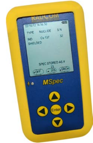
MSpec with protective boot