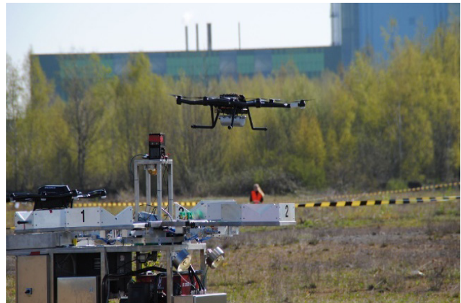
Drone landing on a platform and equipped with a SPIR-Explorer detector