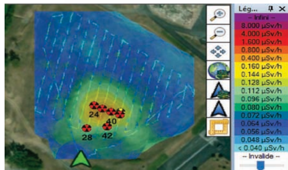
Dose rate map