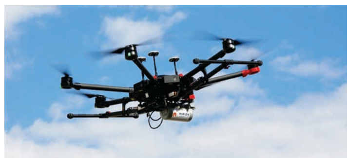
SPIR-Explorer Sensor in operation