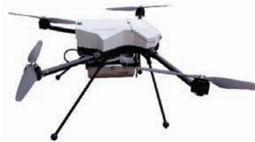
SPIR-Explorer Sensor mounted on an AERACCESS drone