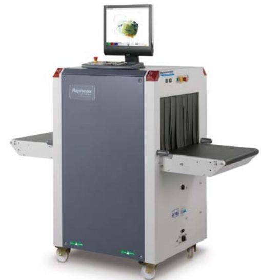
Tunnel Opening 21.3 x 14.2 in

The new Rapiscan 618XR hp is a high performance 21.3 x 14.2 in (540 x 360 mm) tunnel aviation checkpoint screening system with best in class image quality and excellent threat detection capabilities.