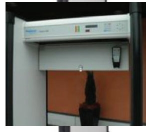
MRCS 5116 P/N 20106468

Wireless bidirectional remote control of all Metor parameters