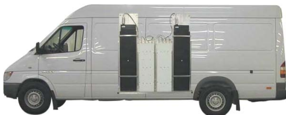
Cut-away view of the TSA MD134 mounted in a van for mobile screening. (Van is not included.)