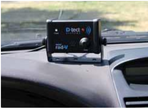
Figure 6: In-Cab Display Module

Contact your local Department of Transportation for information regarding regulations for dashboard-mounted displays, as these may vary from state to state. The In-Cab Display module must be connected to the External Detector module via the communication cable. Depending on the vehicle model and configuration, this cable can usually be run under the dashboard and through the engine compartment.