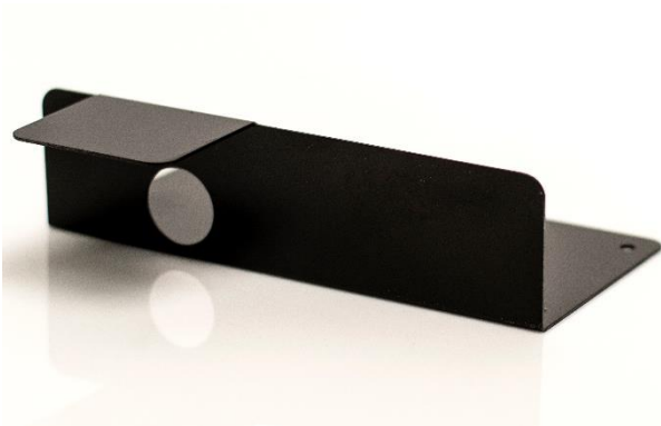
Figure 3: Protective Shield