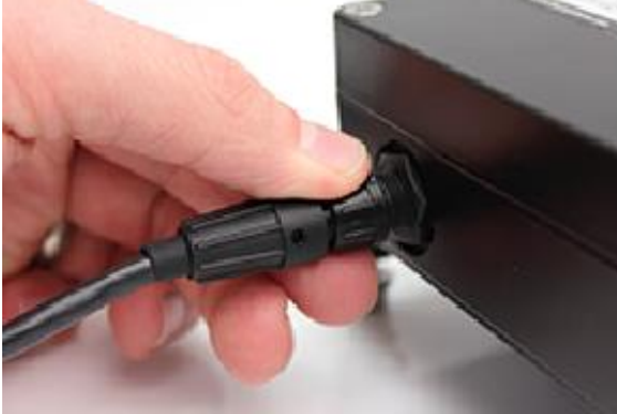
Figure 7: Installing Cables