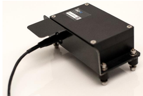
Figure 4: External Detector with Protective Shield