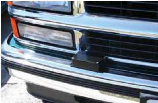
Figure 5: External Detector Module

Make sure that neither the mounting equipment nor the position of the module affects the operation of the vehicle in any way. Take special care if mounting the External Detector module under the hood to avoid placement near the engine block, exhaust lines, compressor, or other hot/cold areas, as exposure to extreme temperatures may damage the device. Also, make sure to avoid engine belts and electrical wires, and confirm that the power and/or communications cables of the modules are secured and isolated from moving parts and hot surfaces.