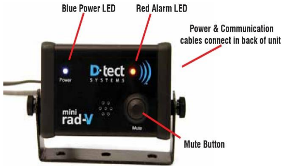
Figure 1: In-Cab Display Module